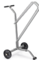
Small Music Stand Move & Store Cart will hold up to 10 RoughNeck Stands.

Move music stands from rehearsal room to performance area and back again with ease.