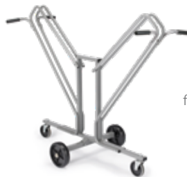
Large Music Stand Move & Store Cart will hold up to 20 RoughNeck Stands.

039D201 Small Music Stand Move & Store Cart, 21 lb (9.5 kg)