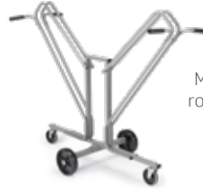
Large Music Stand Move & Store Cart will hold up to 24 Preface Stands.

039D201 Small Music Stand Move & Store Cart, 21 lb (9.5 kg)