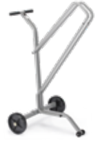
Small Music Stand Move & Store Cart will hold up to 12 Preface Stands.

Move music stands from rehearsal room to performance area and back again with ease.